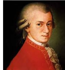
Wolfgang Amadeus Mozart 1756 – 1791

Tickets: £7.- (Students £ 5.-) includes a complimentary drink & nibbles Tickets available via the above two Societies Limited tickets available, please book early